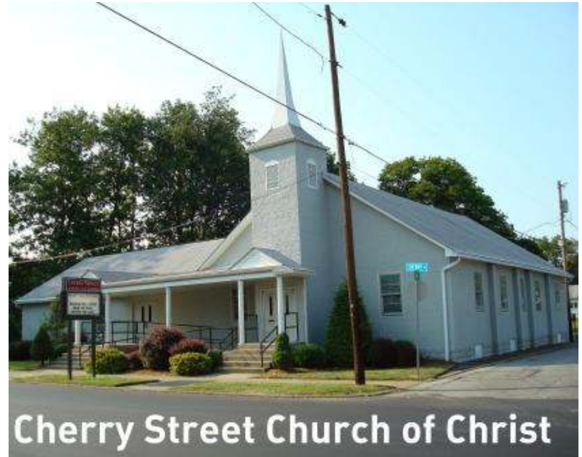
Cherry Street Church of Christ

Web Site: http://cherrystreetchurchofchrist.com